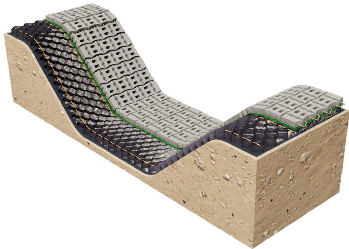
EPEC BLOCK CHANNEL PROTECTION (TENDON TIED TO WASHERS WITH ACB)