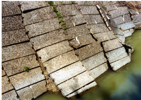
Figure 2. USACE Cable Tied Concrete

ACBs present in today’s market are typically cabled systems of varying geometric shapes and have varying hydraulic performance thresholds. Typical modern ACB units range in area from 0.093 m 2 to approximately 0.28 m 2 , in thickness from 7.62 cm to 22.9 cm, and in unit weights from 98 kg/m 2 to 440 kg/m 2 . Modern ACB systems can be manufactured either by the dry cast or wet cast method. ACB revetment systems can have the individual blocks arranged within the mats in a linear or staggered format, can have the individual units interlocked, and may have the cable either cast into the blocks or inserted after the block has been manufactured. ACB revetments can have “dome” tops or flat tops, and