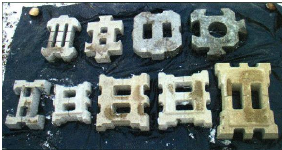
Figure 3. Typical ACB Systems currently available on the open market

its thickness can vary by 12.5 mm along the direction of flow (tapered ACB). Examples of modern ACBs are shown in Figure 3. Every ACB system is unique and needs to have full-scale flume testing results to determine the performance parameters that can be reliably used by the design engineer.