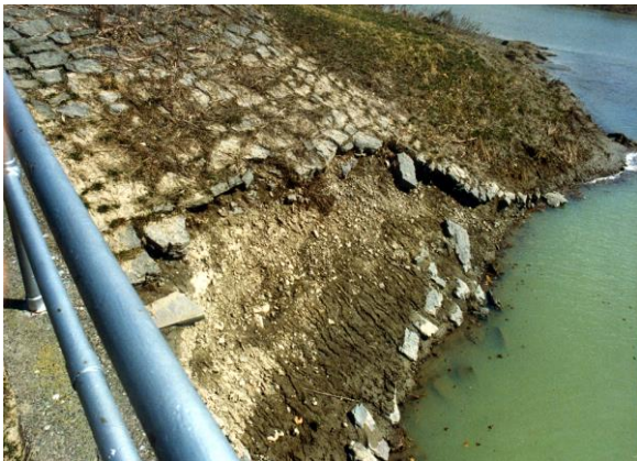
Figure 1. Grouted riprap

Rock riprap has been used for years to control erosion without reliance on vegetation. The size of the rocks employed is directly related to the hydraulic forces that can be withstood. Quarried rocks, in which flat surfaces are present, were the next logical step in the use of riprap. This was followed by grouting these flat topped surfaces together to form a relatively smooth surface for the water to flow over, thus eliminating many of the moment arms created with angular rocks (as shown in Figure 1) and, thereby, increasing performance of these systems. The USACE developed a “cable tied” concrete mat system in the 1970s, consisting of concrete “blocks” approximately 0.61 m by 1.22 m cast on steel cables and rolled up, which were commonly deployed from barges along rivers to slow down erosion from seasonal flooding (shown in Figure 2). This appears to be the first time individual blocks were connected via cables and can be considered the forerunner of the modern ACB revetment systems seen today.