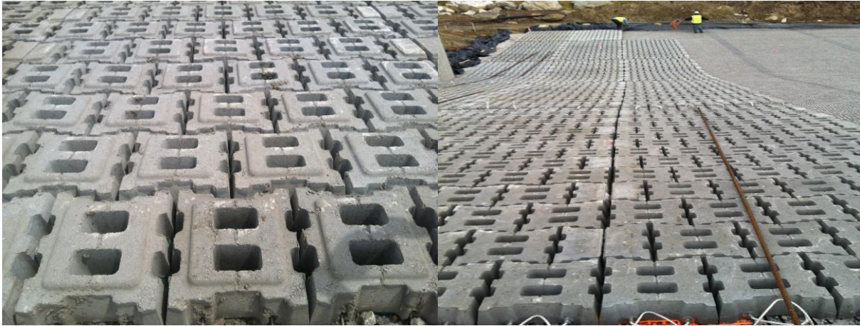
Figure 5. Interlocking Dome Top ACBs